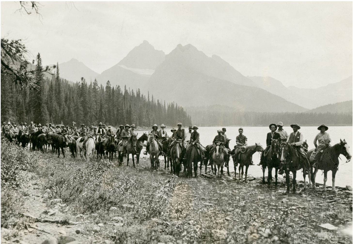
Tourists on Horseback, Red Eagle Lake, Glacier National Park, Undated