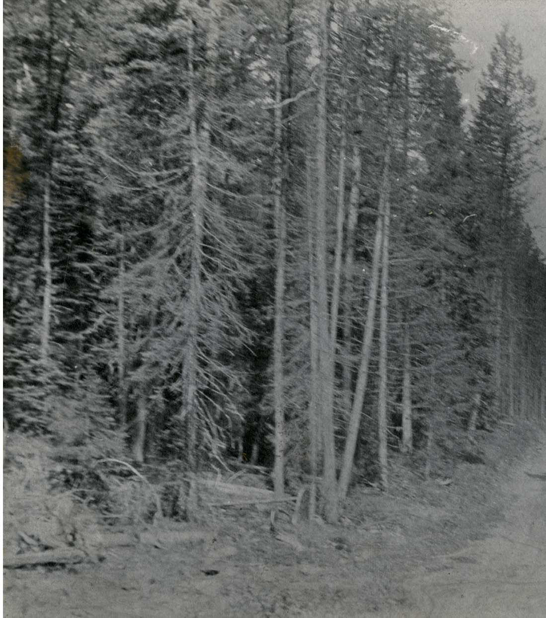
The Old Road from Belton (West Glacier) to Lake McDonald, Undated

Prospecting for mineral continued for ten years. Thousands of dollars went into holes in the ground and into the old Cracker mill at Cracker lake. The prospects were abandoned one by one. There remains at this time, so far as this writer knows, but one miner’s tent, about