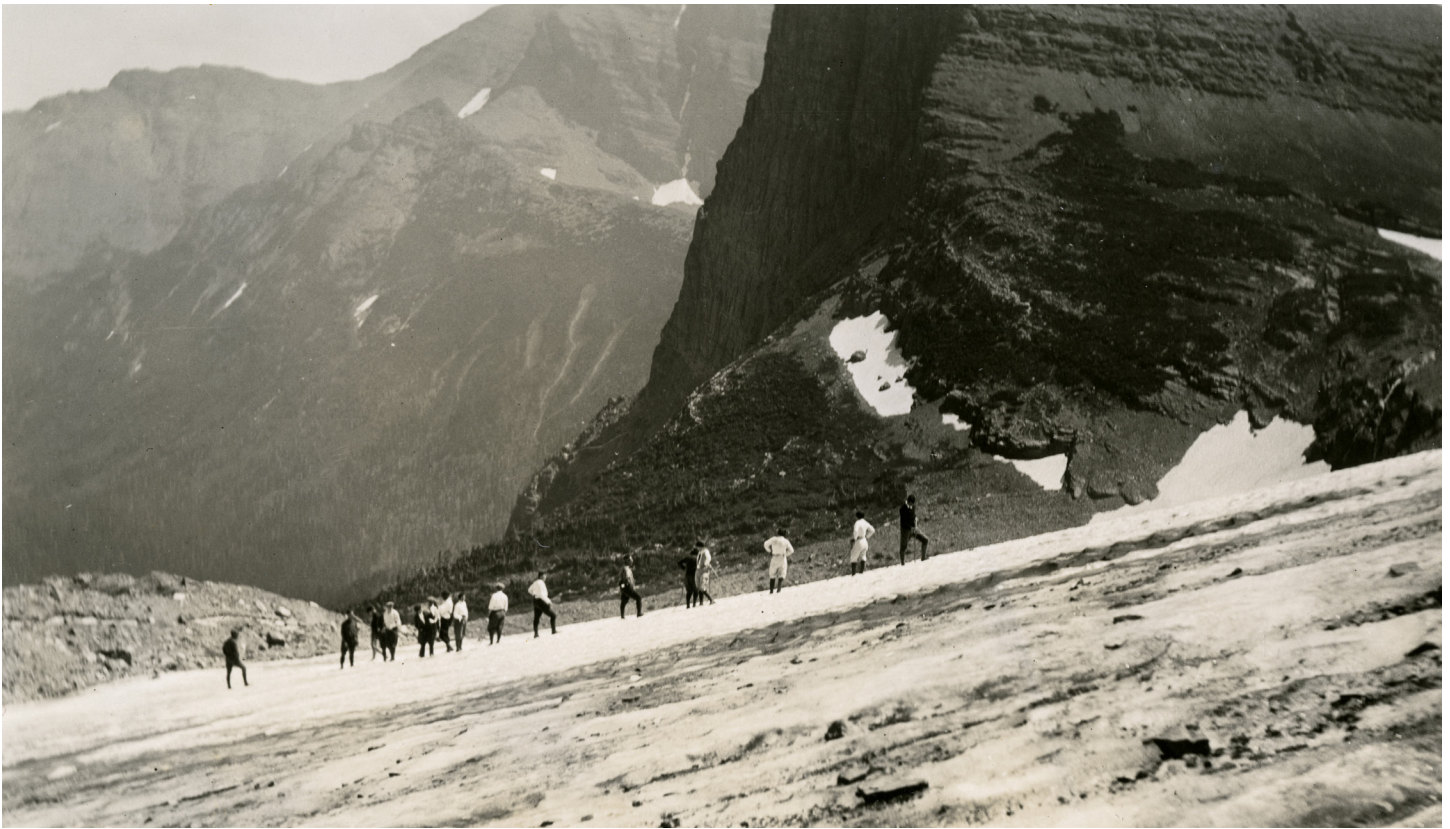
Tourists on Grinnell Glacier, Undated