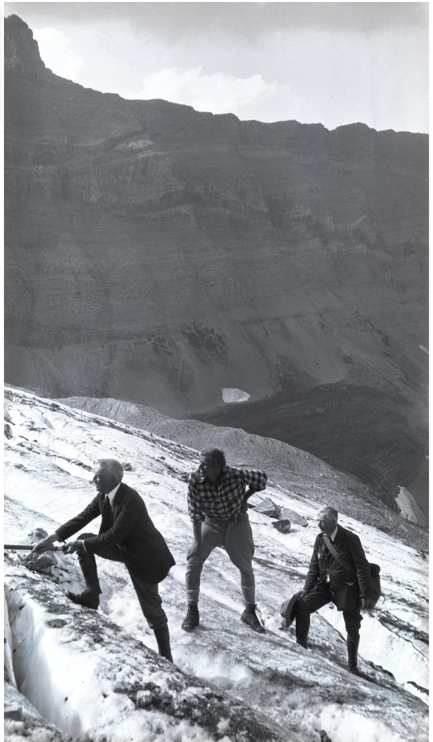
Morton Elrod, Winold Reiss, and George Grinnell on Grinnell Glacier, 1926

A s he conducted this research and did the writing, usually in fragments, he also indulged a lifelong fascination with mountain climbing as described in some of his Cosmos Club papers. 80 In 1911, he published an article about an “electric storm” in