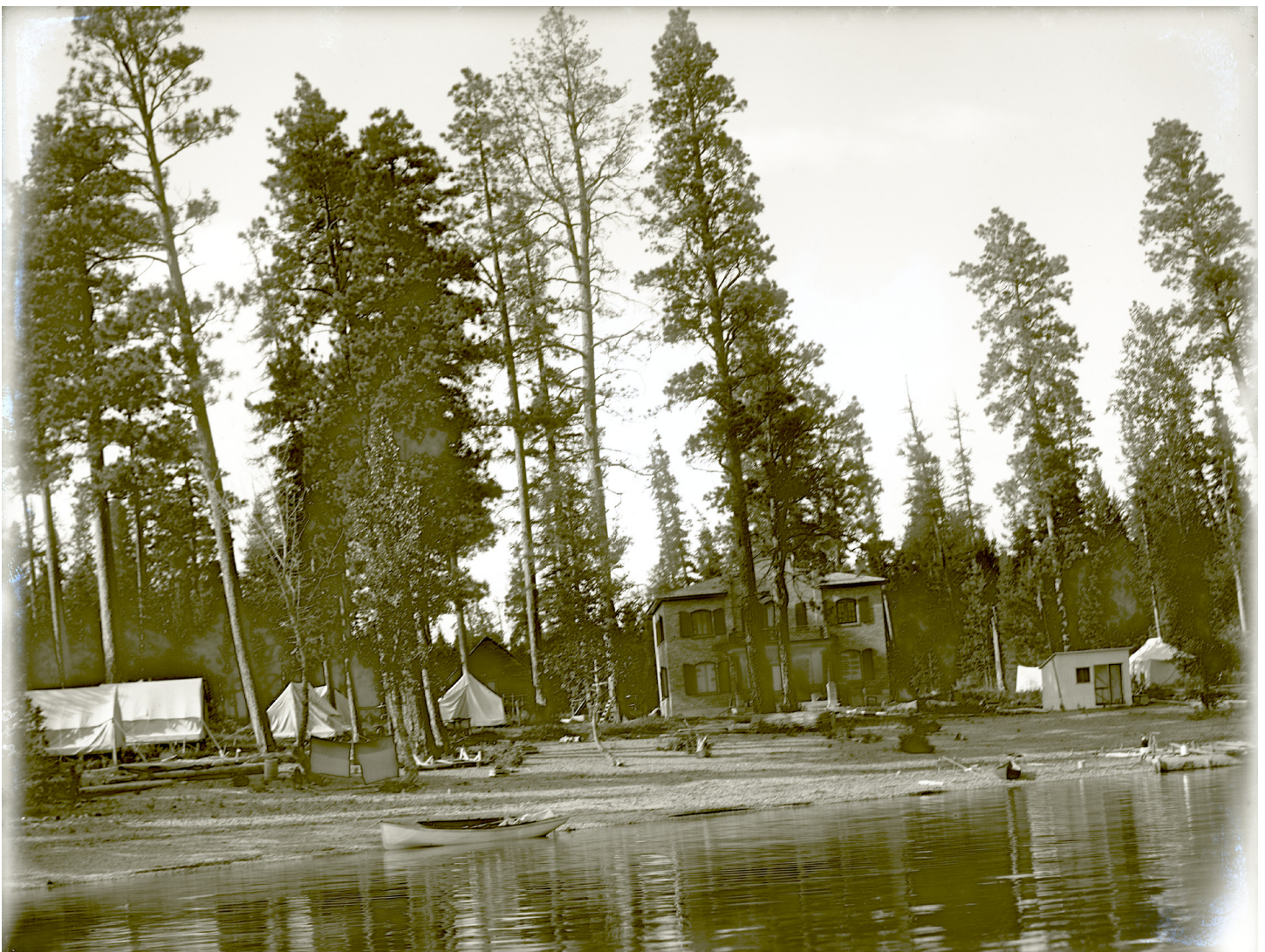
University of Montana Biological Station at Yellow Bay, Flathead Lake, 1913